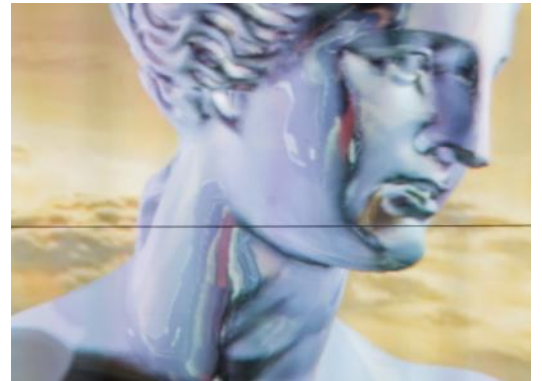
Figure 5: Reflection of the ambient scene on a smoother surface