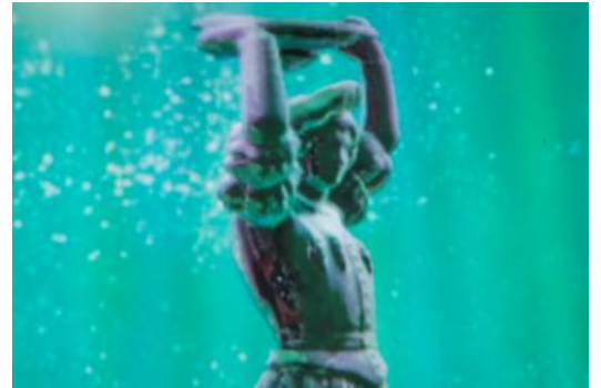
Figure 4: Reflection of the ambient scene on a complex model